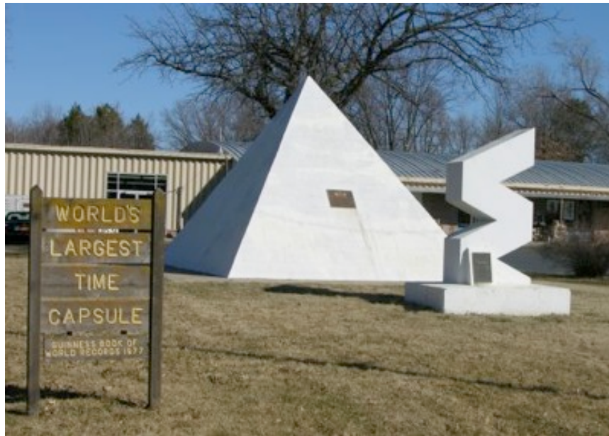
Time Capsule 21, Andy Warhol